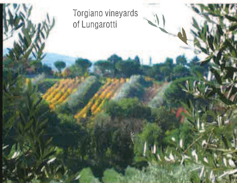
Torgiano vineyards of Lungarotti